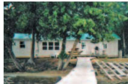
Only cabin on the lake.

Accommodates (12) 2 bedroom Minimum party- Inquire walleye, northern FISHING: This stained water lake is truly an angler's paradise with 5 interconnecting lakes to fish and explore. The wall-