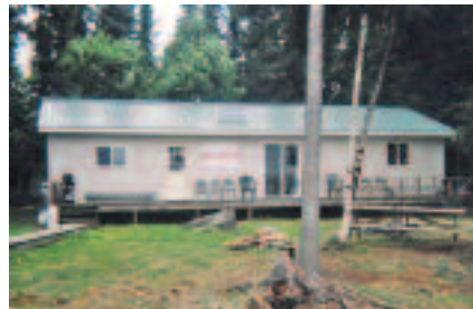
Only cabin on the lake.

Accommodates (12) 3 bedroom Minimum party- Inquire walleye, northern FISHING: This dark stained lake has two flowages feeding into it to produce the quality and quantity of walleyes, and northern