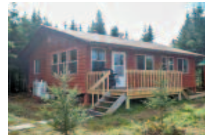
Only cabin on the lake.

Accommodates (8) 2 bedroom Minimum party- Inquire walleye, northern FISHING: This stained water lake is the headwaters of the Meen River system. A medium-sized lake with countless weed