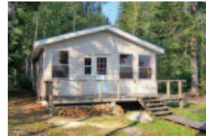
Only cabin on the lake.

Accommodates (6) 2 bedroom Minimum party- Inquire walleye, northern FISHING: A smaller dark water lake with 4 portage lakes is perfect for those who like to explore lots of water while not being