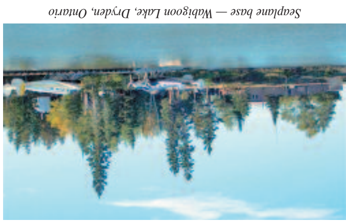
Seaplane base — Wabigoon Lake, Dryden, Ontario

L & M FLY-IN OUTPOSTS BOX 78 INTERNATIONAL FALLS, MN 56649