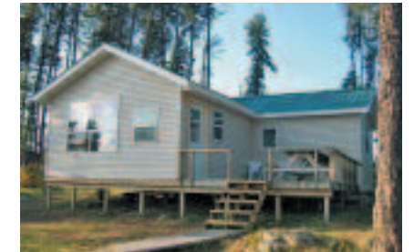
Only cabin on the lake.

Accommodates (6) 2 bedroom Minimum party- Inquire smallmouth bass, walleye, northern FISHING: This stained water lake is perfect for the outdoor enthusiast who likes to portage and